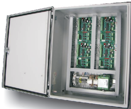
ER-110 control cards Eight Evaporators

The ER-110 was designed specifically to control (EEV) electronic expansion valves and (EPRV) electronic pressure regulating valves to logically provide maximum efficiency with ever changing conditions.