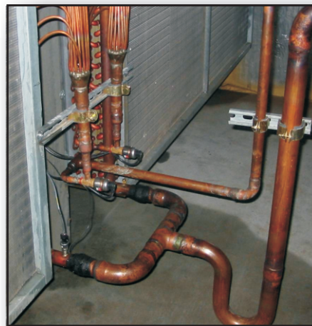
Each Evaporator contains a EEV (electronic expansion valve), pressure transducer and a suction temperature sensor.

The ER-110 uses a suction pressure transducer and suction temperature sensor to measure the Super Heat of the Evaporator. The ER-110 will then adjust the EEV to maintain the Super Heat Setpoint. When used in conjunction with the CR-110 the Super Heat Setpoint may auto range to satisfy the compressor requirements.